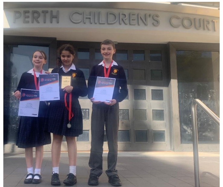
Part of the Team outside the Perth Children's Court.