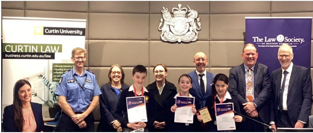
The Team with the competition judges from the Perth Children's Court, Curtin University, WA Police and the Law Society.